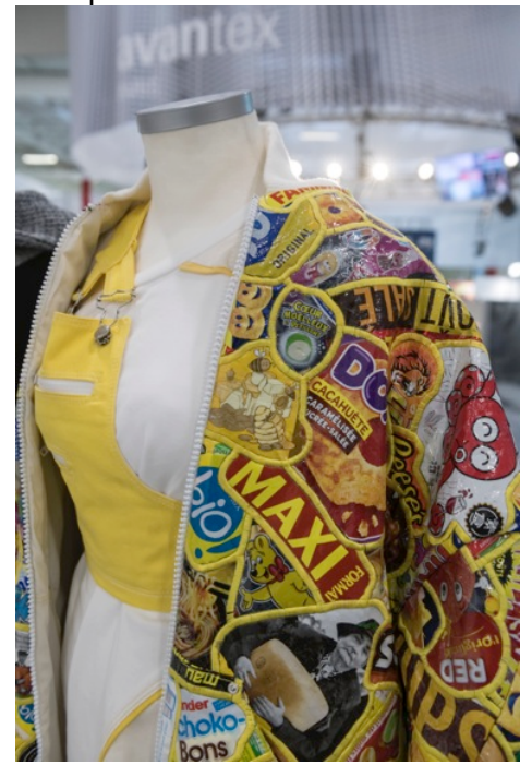
ESMOD - Jacket by Lorena Mazo-French